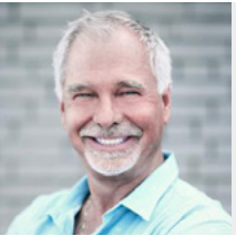
TONY DE LEEDE Renowned Wellness and Fitness Entrepreneur